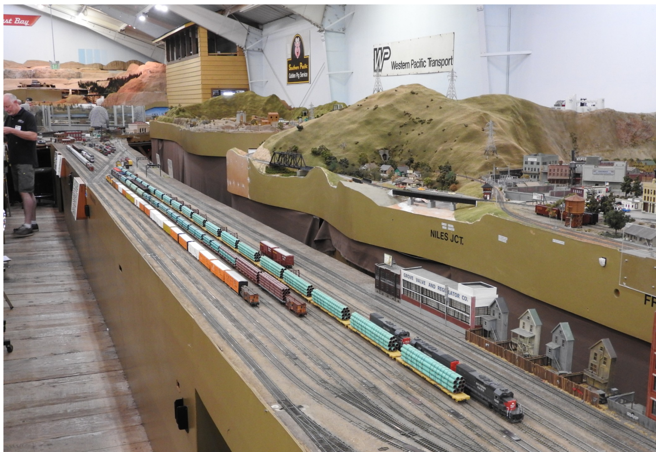
S. Skold photo above