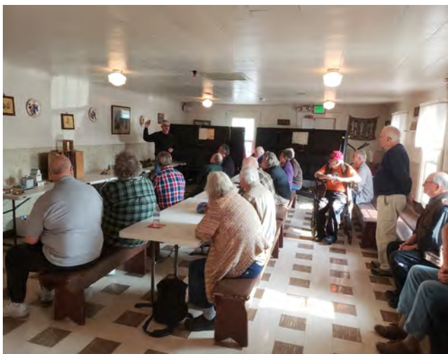
Fall 2019 Meeting

Parking is behind the building. Doors open at 10:00 am with the meeting starting at 11:00 am.