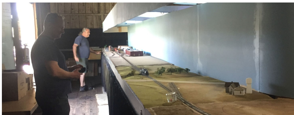
Looking south to Santa Rosa.