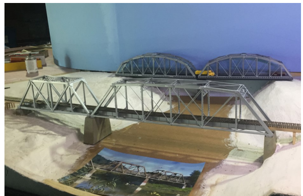
Bridges over the Russian River—Healdsburg