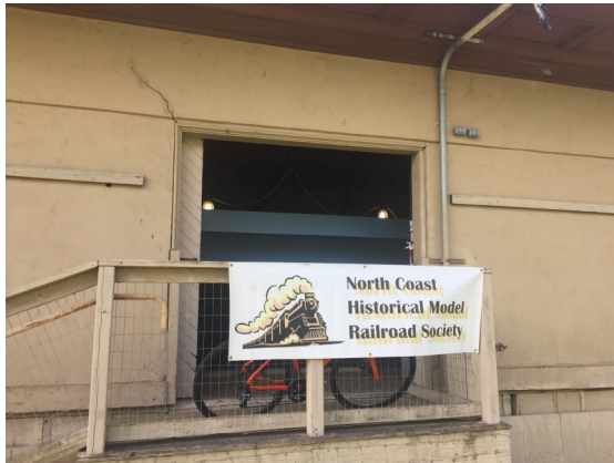
Club Entrance from the parking lot.

North Coast Historical Model Railroad Society (NCHMRS)