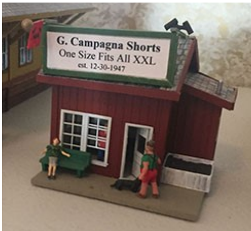
Model by Skip Rueckert

For Show and Tell, attendees presented model structures, a book review, a holiday layout review, a backdrop painting example, and timetables/dispatcher's sheets. Steve Lewis reviewed his activities with the Boy Scouts Railroading Merit Badge and the need for additional people to help with the excellent program.