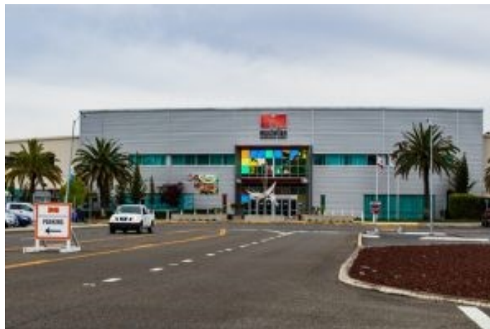
McClellan Convention Center—Sacramento, California

The Sierra Division of the Pacific Coast Region and the Feather River Rail Society invite you to attend the Diamond Rails Forever 2019 Joint PCR/FRRS Convention in Sacramento, California, at the McClellan Convention Center, 5411 Luce Ave, McClellan Park, CA 95652. Several rooms have been reserved within the Center for clinics, presentations, the banquet, and the PCR breakfast. A map of Convention Center will be provided here ( MAP ) in the near future. The specific details are available on the convention website ( http://pcrnmra.org/conv2019/ ). The convention is a joint venture with the Feather River Rail Society. Hotel Rooms are sold out. See the Hotel page for alternate hotel room information.