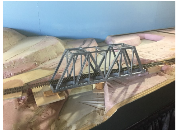
The bridge of the Petaluma River. It will be converted to a working drawbridge and will be in the up position by default. Arduino controls will sense an oncoming train and lower the bridge.