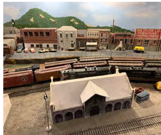
Station and yard at Petaluma