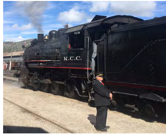
Nevada Northern #93 2-8-0, Ely, NV