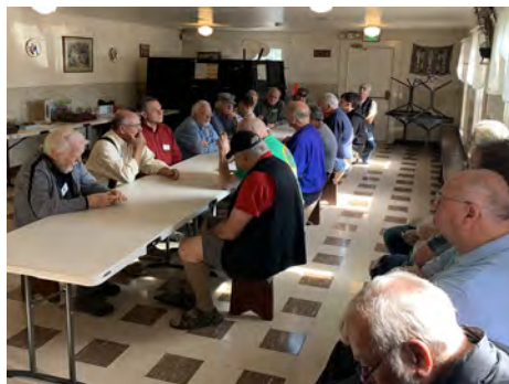
Waiting for the meeting to start.

stock as well as club holiday events. On Saturday, November 16th, the Fall RED meeting took place at Monroe Hall in Santa Rosa. The full report is available on pages 4, 5 and 6. Below are a few photographs from the meeting.