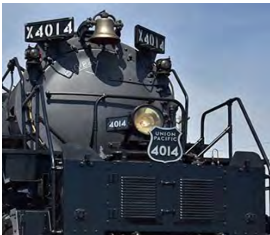
UP Big Boy 4014 - Columbus, NE