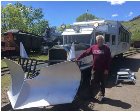
RGS Galloping Goose #7 - Golden, CO

When the opportunity arises, I enjoy visiting prototype railroads, especially if steam is involved. The visits jump start my creativity and interest in tackling a project that's been sitting on the shelf much too long. This year, I did a few road trips to visit family and friends. Along the way I managed to visit the Colorado Railroad Museum in Golden, Colorado, the Illinois Railroad Museum in Union, Illinois and the Nevada Northern in Ely, Nevada. By pure chance I was traveling through eastern Nebraska when Union Pacific's restored Big Boy, #4014, was starting its tour of the Midwest. Here are a few shots from my summer travels.