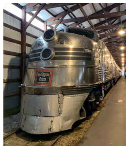
CB&Q EMC C-5A - Union, IL