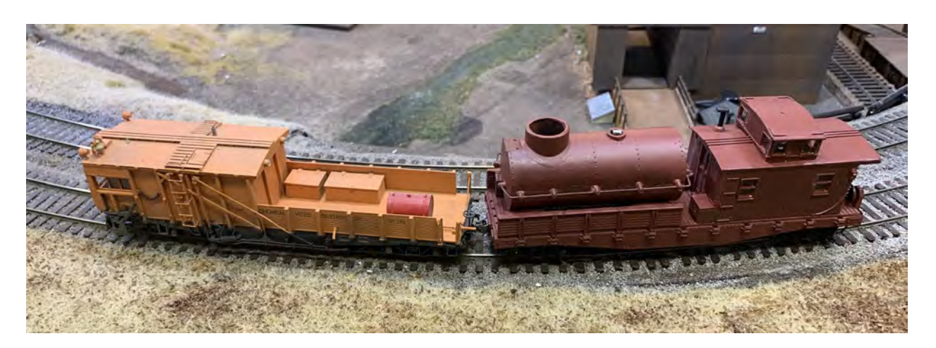
Tender with weed sprayer

Oil tanker. This old veteran was about to be scrapped by the NP in favor of newer designs, but the CRAP bought it for the scrap price, slapped its logo on it and put it into service delivering three types of oil to terminals, depots and section areas as part of a supply train. I really like this W&R brass car but I had to make it old and cruddy to justify its presence on the CRAP. And the %#*//#@* thing had a design error. The supplied screws were too short to hold the coupler cover plate on. After hours of searching my extensive brothel of screws with no success, I came up with a solution that I hope no one ever sees! There is still weathering above the foot walks to be done before the model is layout worthy.