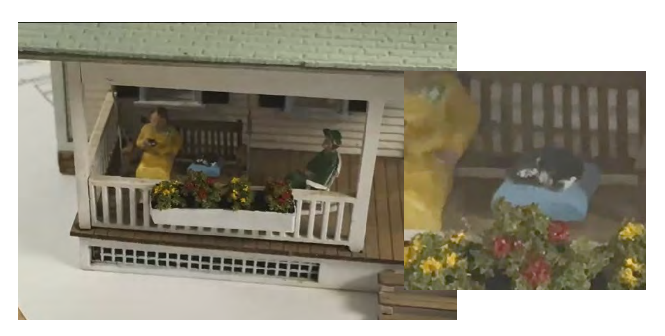
Cat resting on the swing.