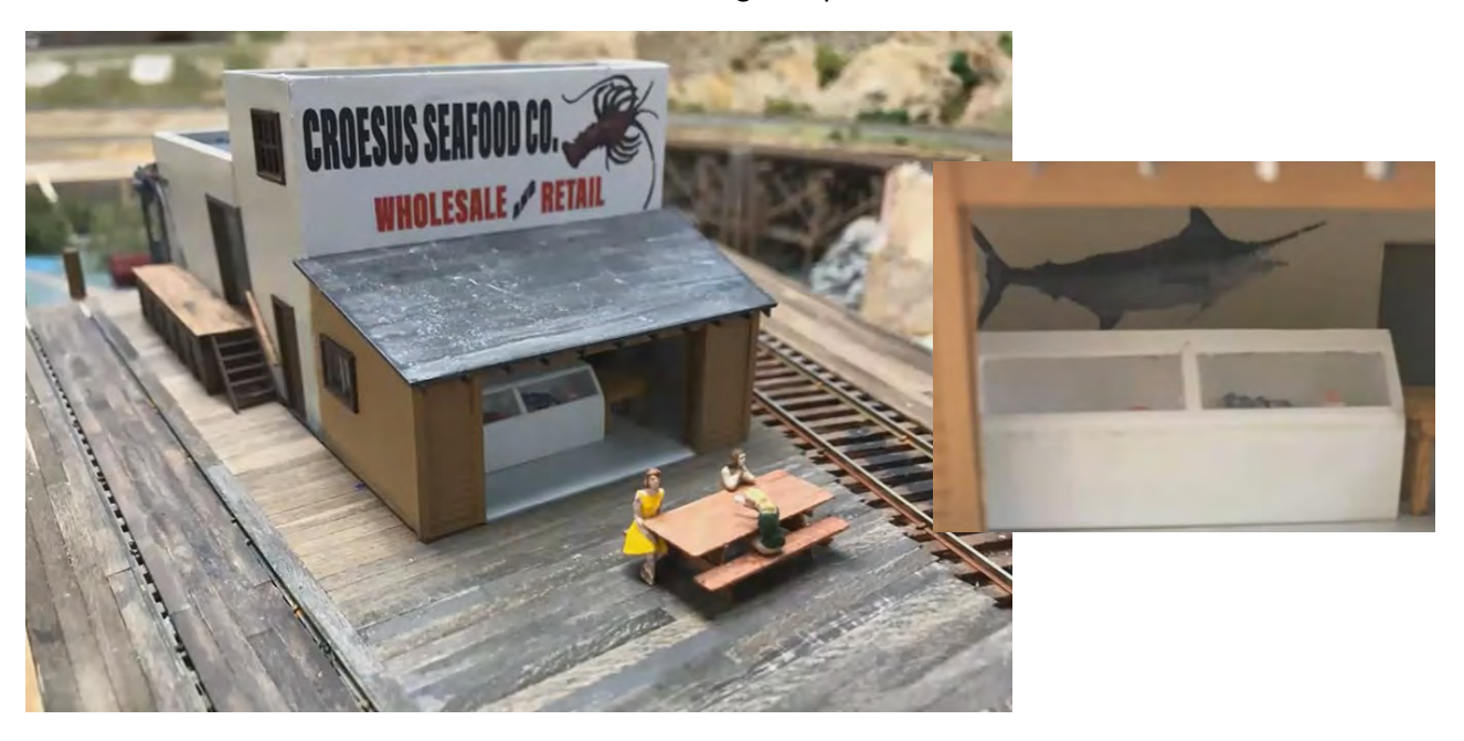
Croesus Seafood Company with invisible fish behind the counter.

Dave has been busy working on adding structures to his layout in preparation for submissions to the NMRA for his Master Model Railroader certificate. Presented at the meeting was the Crosesus Seafood Company with a mounted fish that can't be seen from the layout, a detailed front porch scene with a very small cat resting on a pillow.