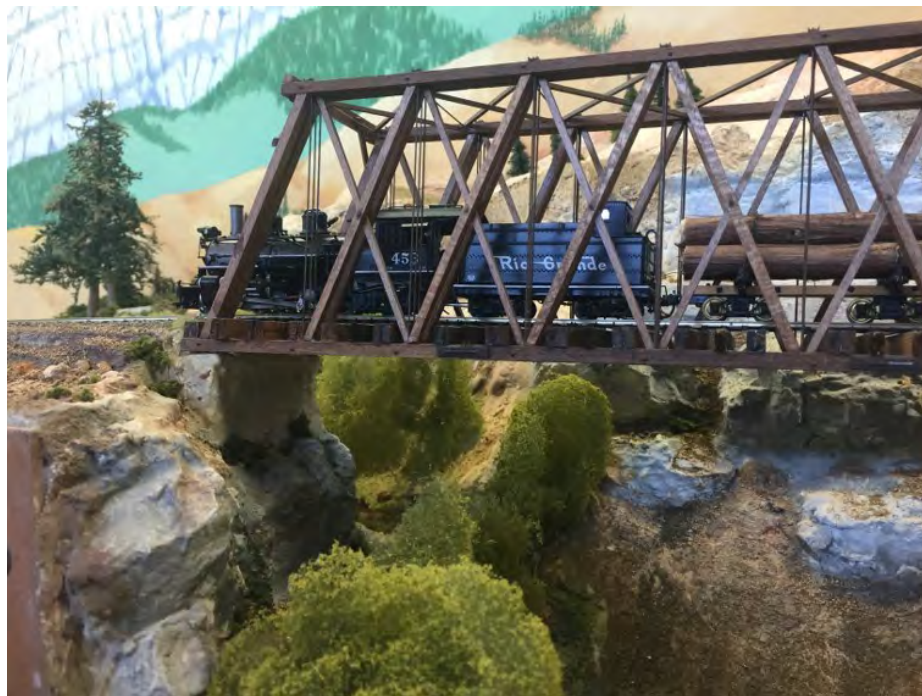
#453 coasts down the line for the last time as abandonment looms in the near future at the LCMRRC.