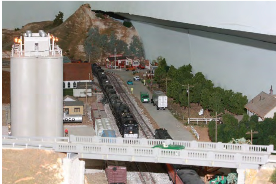
Last views of Zamora on the Lake County Model RR Clubs last run